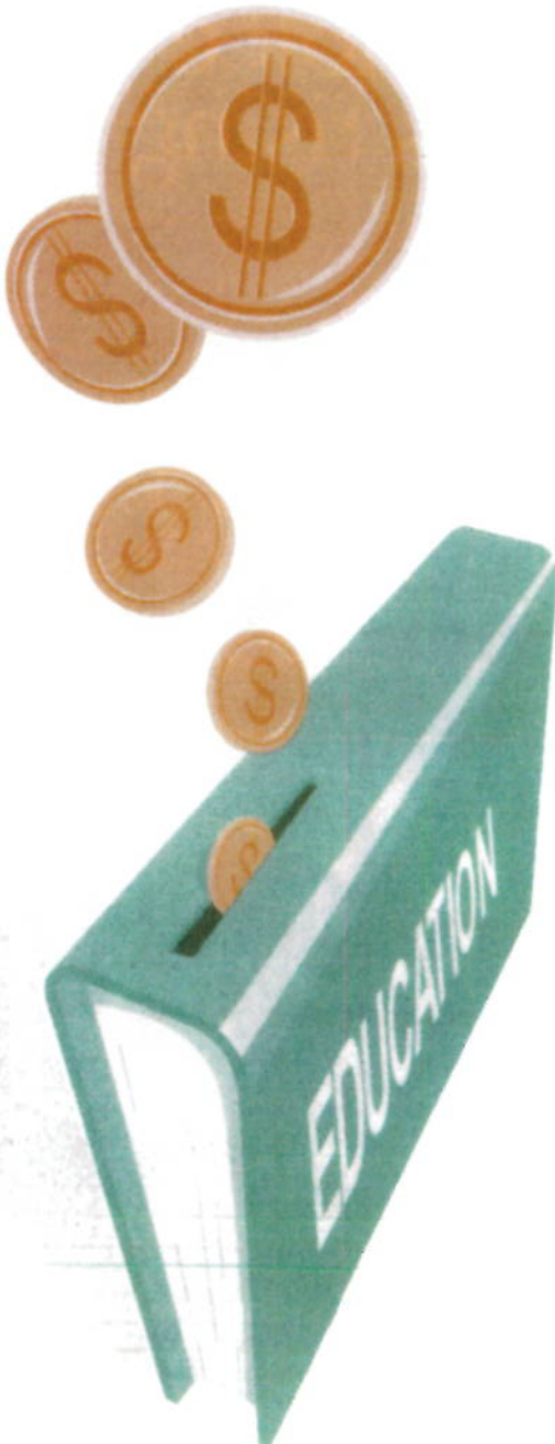
Funding by Source

The Utah Legislature provided for a 7.09 percent increase in funding for the next school year (2015-16).