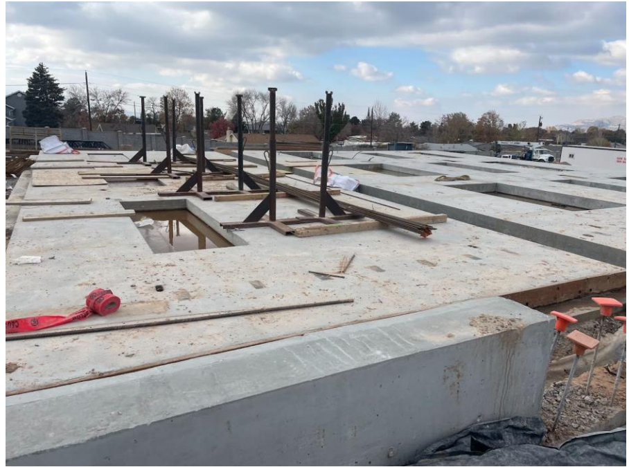
Tilt panels formed and placed