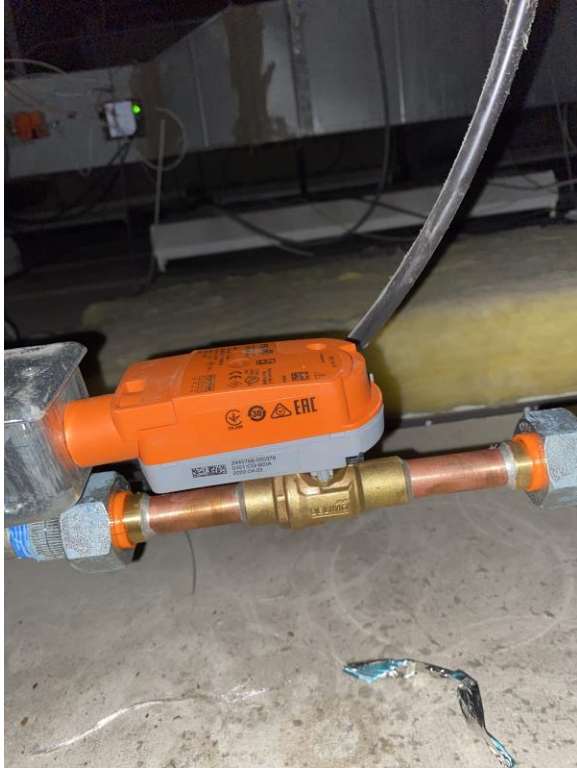
Digital valve and actuator