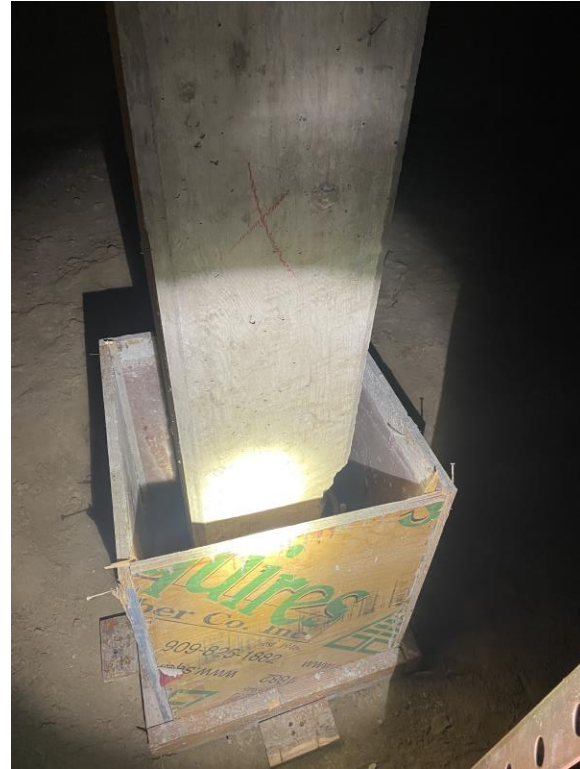
Concrete patch and repairs