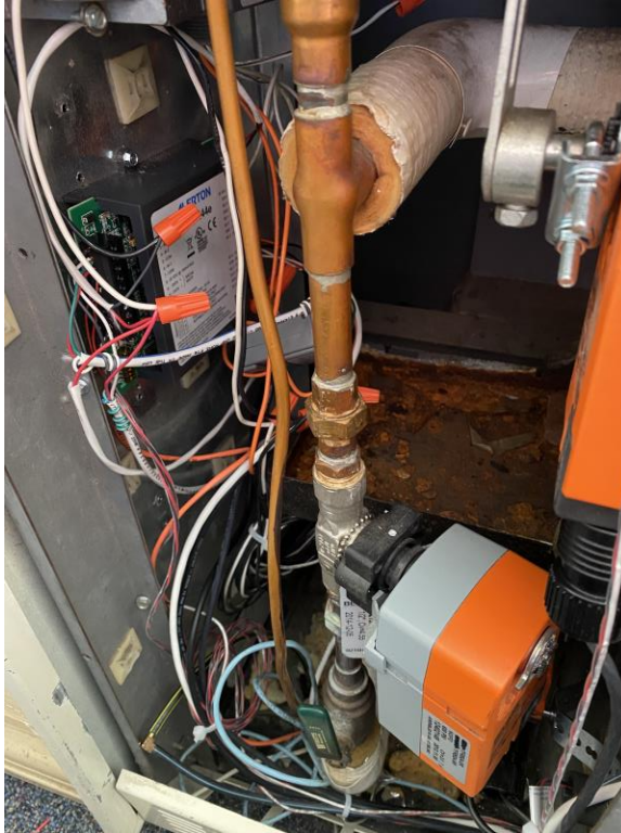
Digital controller and actuators