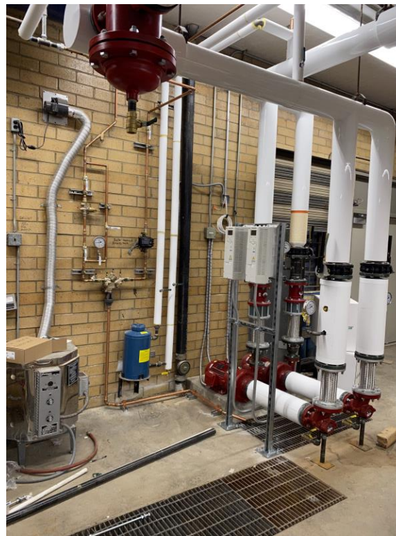
Drives, pumps, meters, and valves