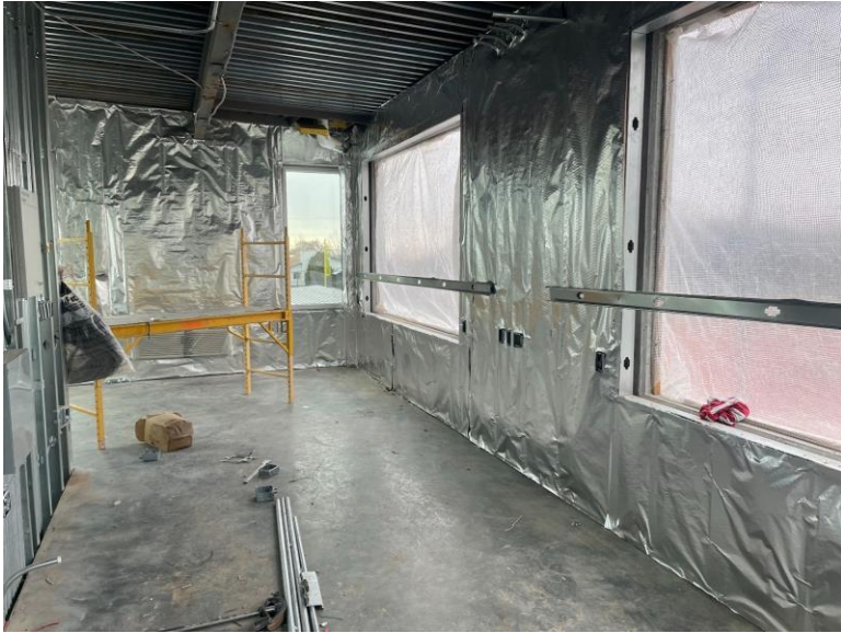
Softball press box insulation