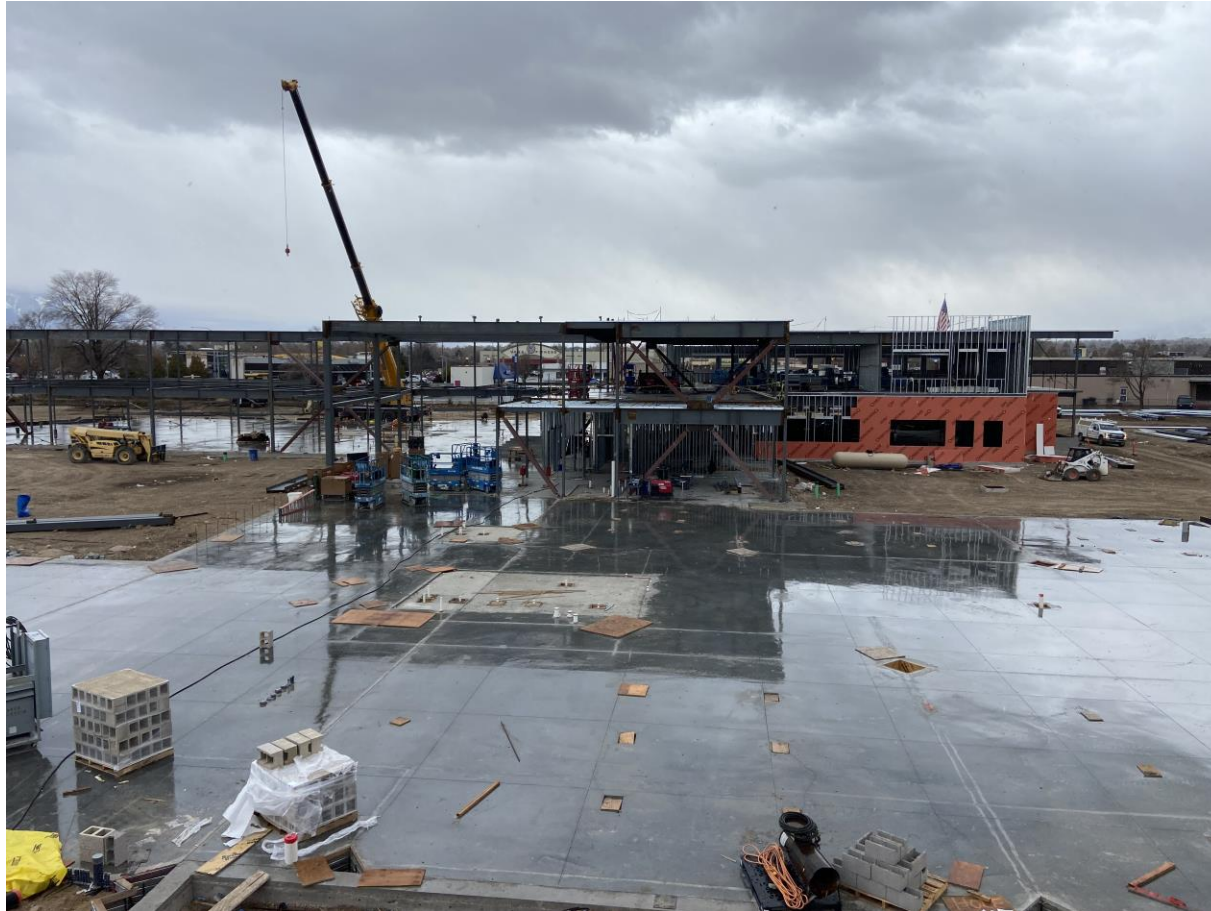
Southern view of academic building in progress