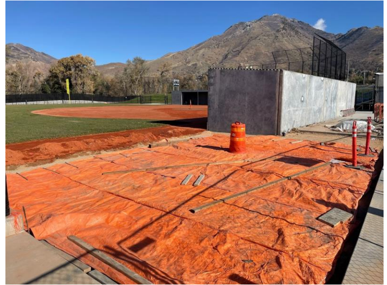
Red dirt on softball field