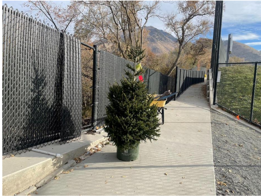
North property line