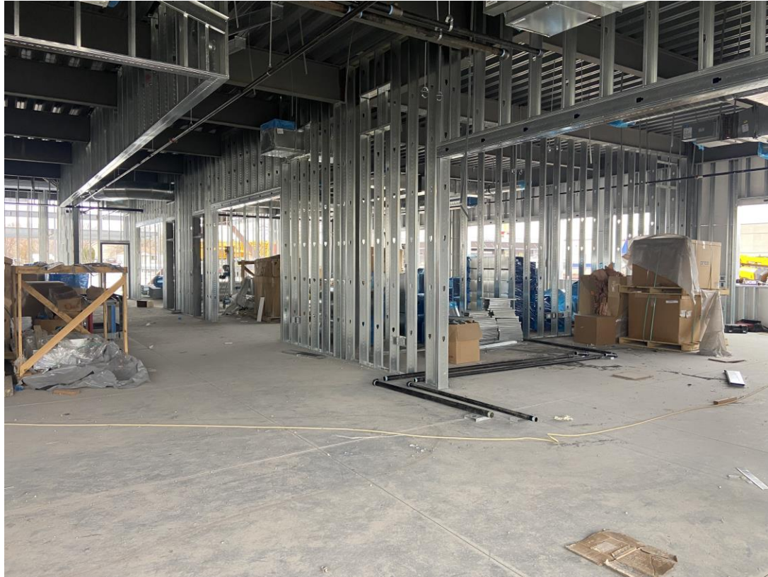
Academic southwest wing ducts, piping, and framing