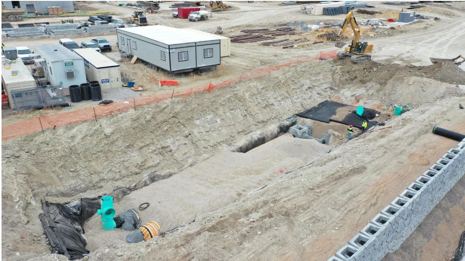
Storm chambers back-filled