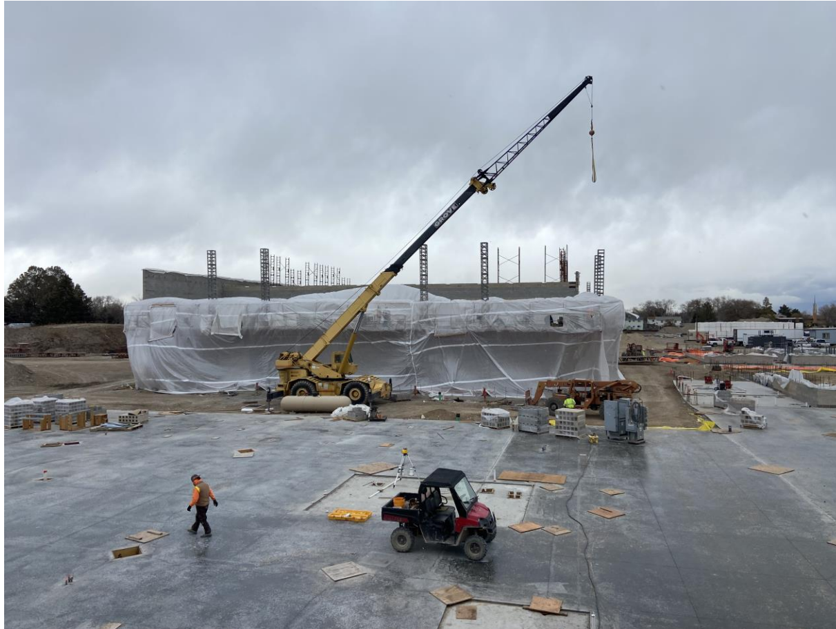
Heated enclosure for masonry on locker rooms