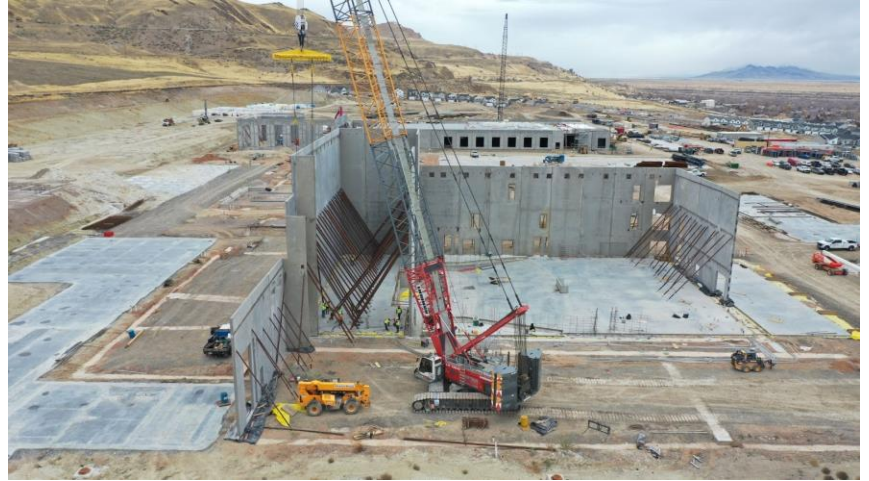
Auditorium tilt walls