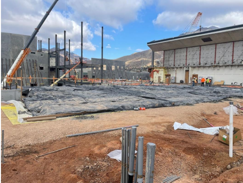
Administration area slab