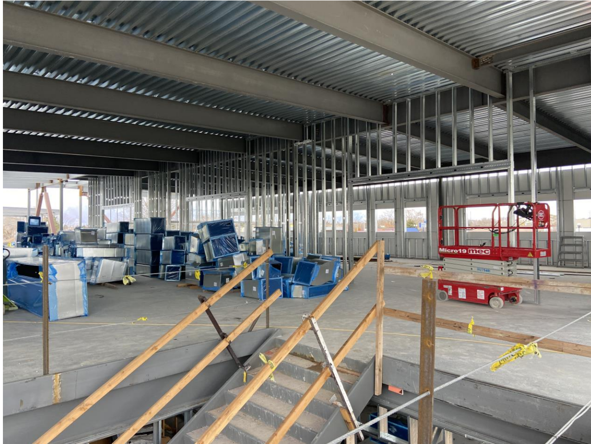
Academic wing 2 nd floor framing