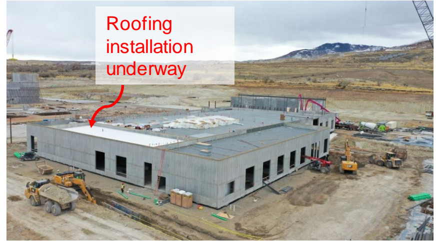
Gymnasium/ pool building